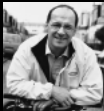
John Swinney MSP Leader of the SNP