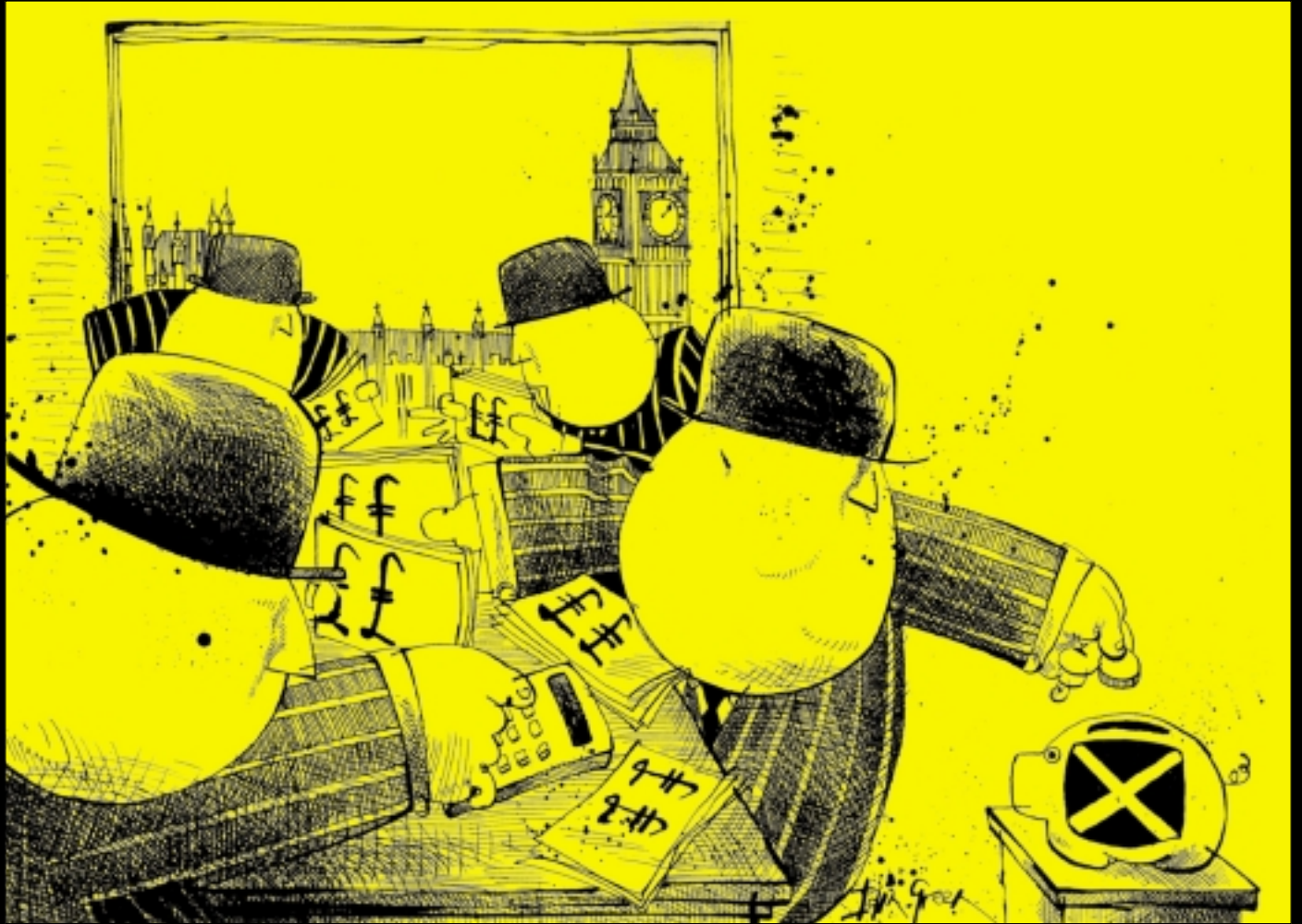
Short changed by London.